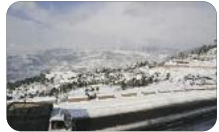
firms, he added.

An official of the EPD on condition of anonymity confirmed that entrance to the park would be ticketed, however the price was yet to be determined. The 40 acres of the park would be fenced by the government and other collaborative