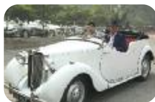
cars for this display.

INH Automotive Specialists, Pakistan’s biggest independent auto shop, supported the 5th Annual VCCCP Cross Country Rally 2014 through a Vintage Car Show. The all-day event was publicly hosted by Vintage & Classic Car Club of Pakistan from 11 AM to 5 PM on Sunday, 16 November 2014 at Royal Palm Golf & Country Club in Lahore. At the event, more than seventy vintage and classic cars from all across Pakistan were showcased, some coming all the way from Karachi and are now heading on to Khyber via Islamabad. INH clientele provided approximately forty