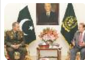
Mr Shoigu is in Islamabad on the first visit by Russian Contd... Pg.7

Signed by Defence Minister Khawaja Asif and his Russian counterpart Sergey Shoigu, the agreement was hailed by Pakistan’s defence ministry as “a milestone” in defence ties between the two countries.